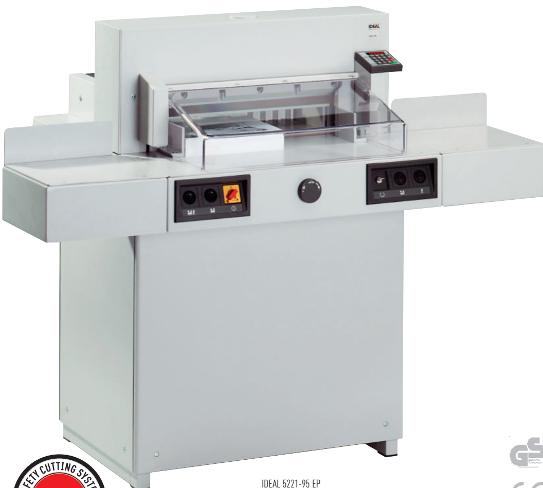
IDEAL 5221-95 EP with optional side tables